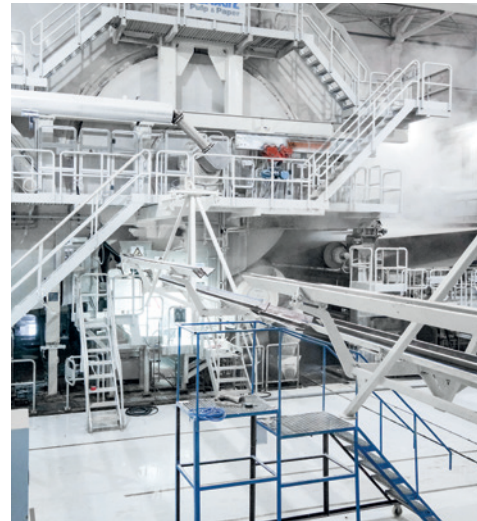
The PrimeDry Steel Yankee is made entirely of steel, has a diameter of 20 feet, and hence is among the largest in the world.