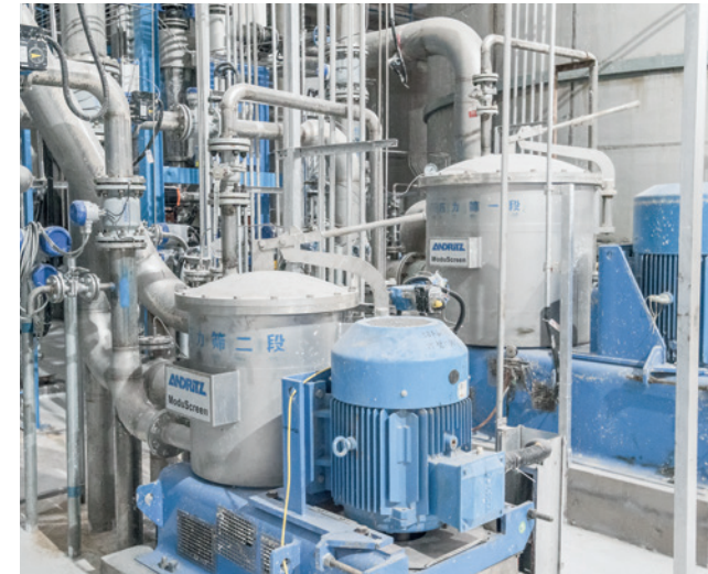
The stock preparation system consists of two lines. One is for LBKP market bale, and the other one for bamboo self-made slurry pulp.

awarded a special certificate to the mill in recognition of social and environmental efforts it has made since tissue production began here.