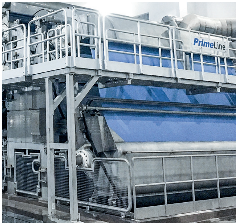
The fully integrated mill makes tissue using bamboo as its main source of fiber. ANDRITZ also supplied the original fiberline.

And what difference has the extra-large Yankee made, added with the steam heated hoods? Sheng says, "As well as maximum output and high-quality products, energy consumption is a very important issue for us. ANDRITZ suggested that with the combination of the steam heated hoods and the increased size of the Yankee, we could get more capacity, longer drying time, and reduced energy costs. And yes, so far we really are noticing a clear difference in comparison to other lines in the group."