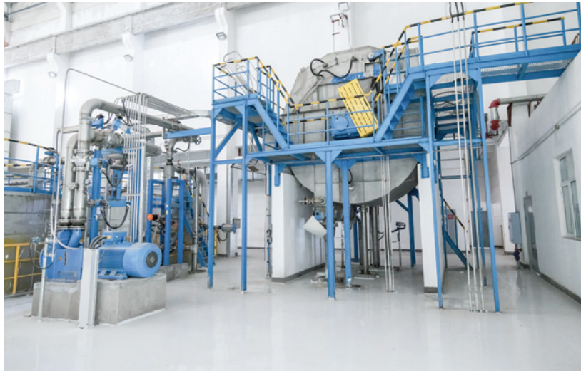
Excess water from the tissue machine is handled in two DiscFilters Saveall, where micro fibers in white water are recovered. This system minimizes fiber loss and lowers fresh water consumption in the mill.