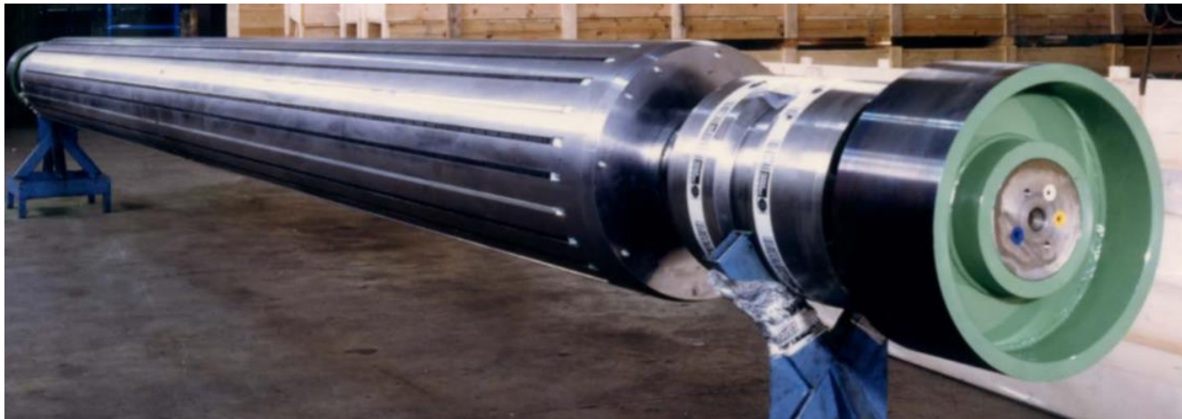
Figure 1. A typical multivalve expanding shaft for the reel.

Safety concerns about out-of-control reels, and possible dangers concerning fire and worker protection, led to further thinking about the shafts. Taking the pneumatic expanding shaft a step further, Svecom developed and patented an independent multiple-valve pneumatic expanding shaft in which all of the valves operate independently with internal check valves. Thus, if there is a failure at one section of the pneumatic system, all the other ledges remain in place and the core is still securely held, even at very high peripheral speeds.